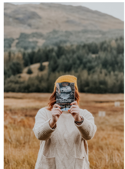
Ad with Visit Scotland (travel)

if you'd like to work with me, please email info@bookersagency.com