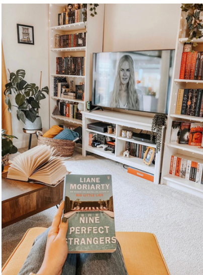
Ad with Amazon Prime (streaming service)