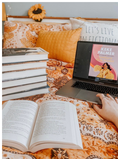
Ad with Amazon Publishing (publisher)